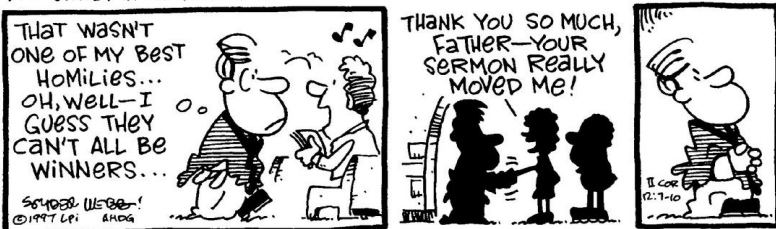
14th SUNDAY IN ORDINARY TIME

This week as we celebrated the Independence of our country, we will do well to echo the Psalmist, saying, “Our eyes are fixed on the Lord, pleading for his mercy.” May we always recognize and use wisely the gifts of freedom and abundance He has showered upon us.